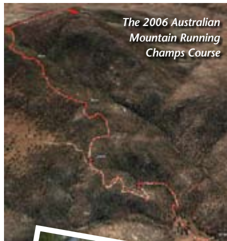
The 2006 Australian Mountain Running Champs Course