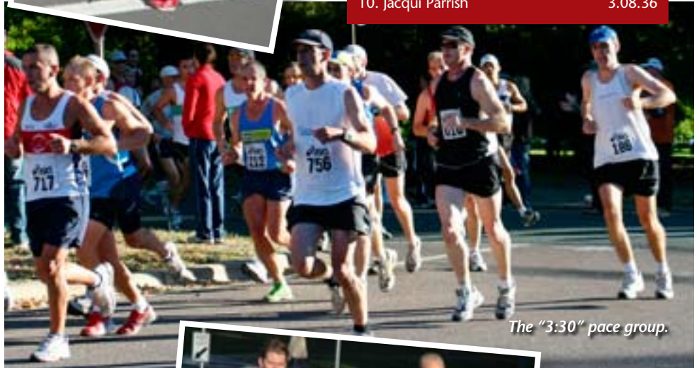
The "3:30" pace group.