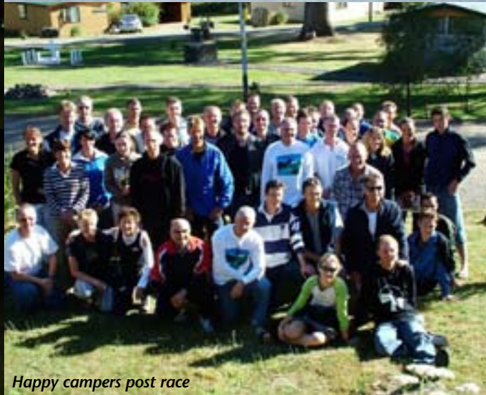
Happy campers post race