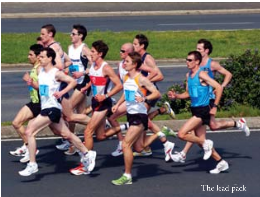
The lead pack