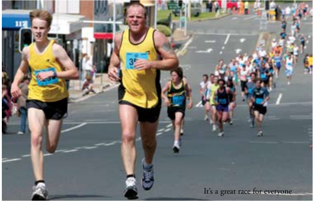
It's a great race for everyone