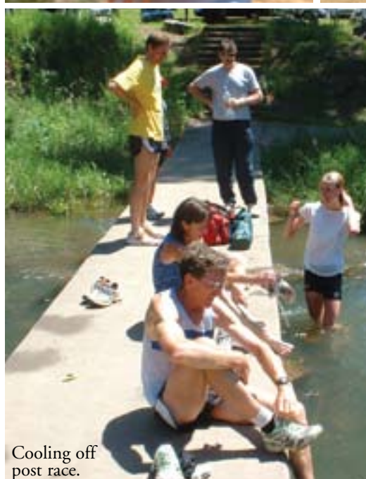
Cooling off post race.